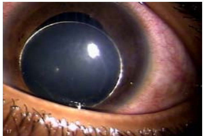
Fig. 4: Anterior dislocation of lens

Surgical treatment of ectopia lentis has traditionally been associated with poor visual outcome and a high complication rate in the past 8 . Numerous