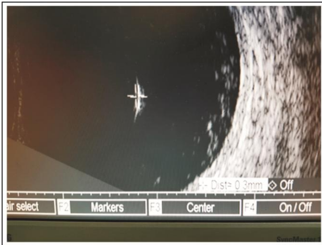
Fig. 2: Ringing bell sign on B - scan. Size of silicone oil bubble is 0.3mm.

This was her third injection in left eye. Her best corrected visual acuity was 20/200 and intraocular pressure was 17 mmHg. She was phakic with no history of ocular surgery apart from intravitreal Bevacizumab. We noted intravitreal silicone oil bubble suspended in superior half of post vitreous cavity but could not capture this finding on fundus camera due to very small and indistinct appearance of this bubble on photography. Her last injection was one month ago. She also remained symptom free.