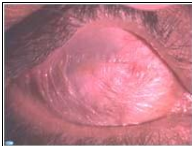
Fig. 1: Severe dry ocular surface in Steven Johnson Syndrome.

pertaining to the use of Boston KPro in eyes with BBI. However, Harissic- Dagher and Dohlman in their paper "The Boston keratoprosthesis in severe ocular trauma" mentioned 6 cases of mechanical trauma out of their total 30 studied cases. In their research anatomic success was achieved in 5 out of 6 mechanically traumatized eyes 6 .